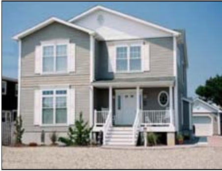
Approximately 2,128 sq. ft. — Two Story